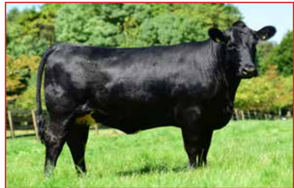
18 Month Old ZFL Heifer from a Holstein Cow