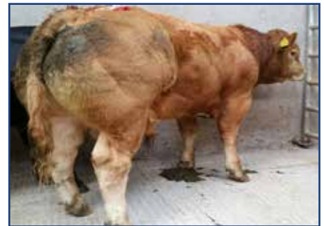
Champion at Kilmallock Weanling Show & Sale 2016