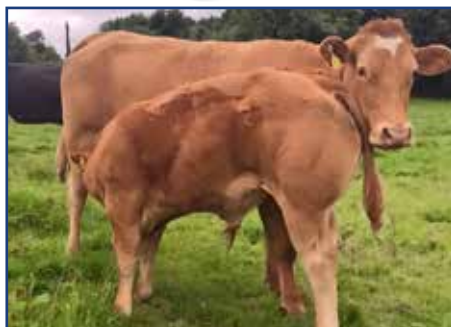
CWI Heifer with an EBY Bull Calf 5 Months Old